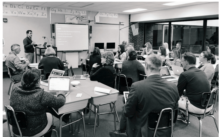
LGES teachers and administrators learned how to add content to the new website.